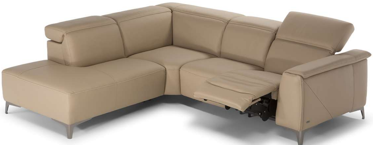
■ Vers. 072+489+001+N02