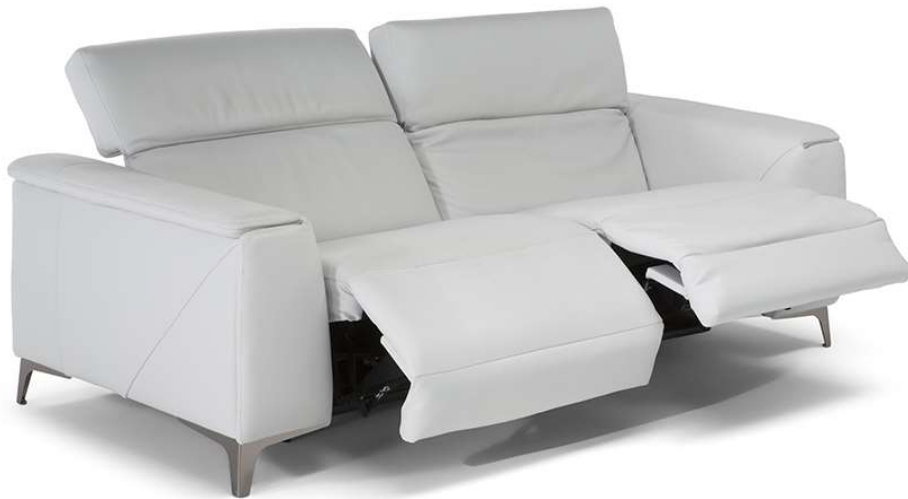
■ Vers. N46