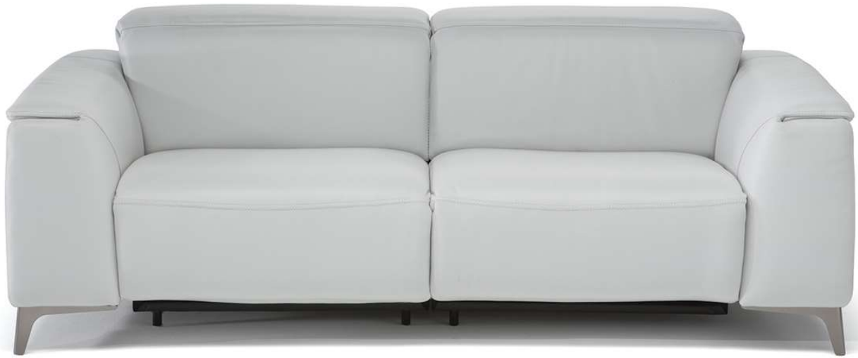
■ Vers. N46