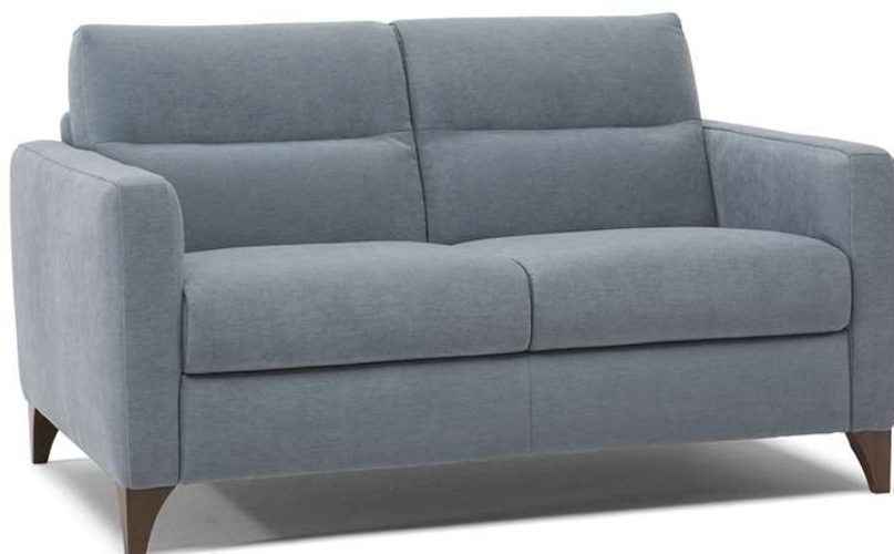
■ Vers. 005