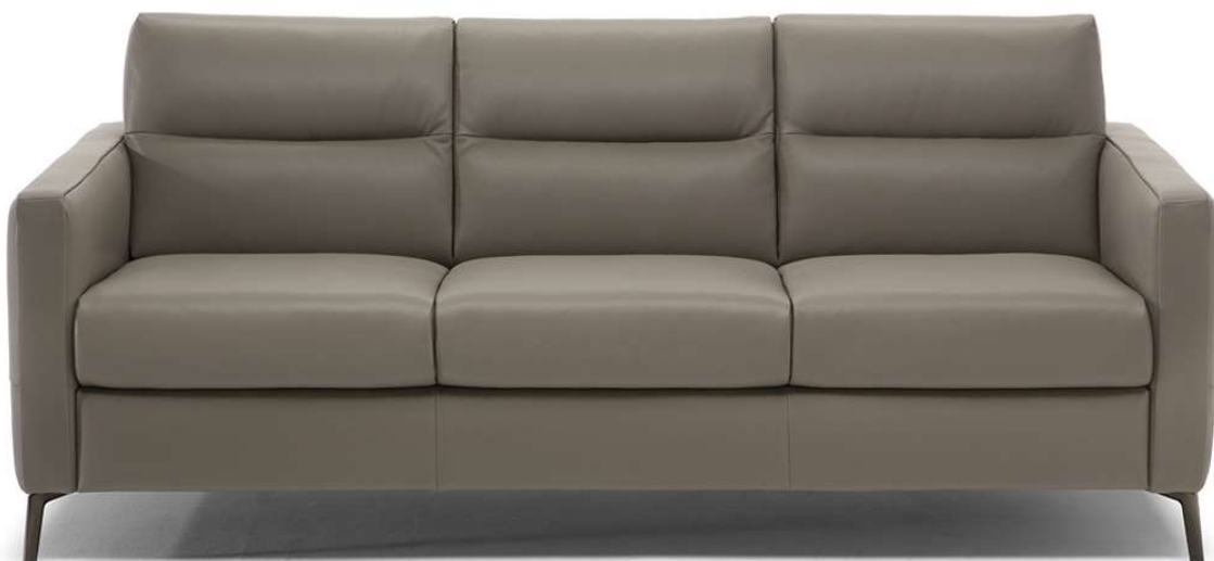
■ Vers. 254