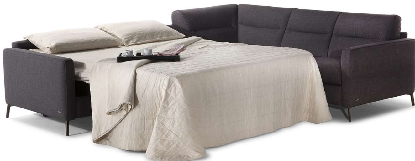
■ Vers. 668+489+287